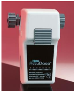
88301 single, low flow 88331 single, high flow

Low Flow units for filling bottles ** High Flow units for filling pails