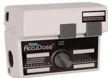
88681 5 products 4 low flow, 1 high flow