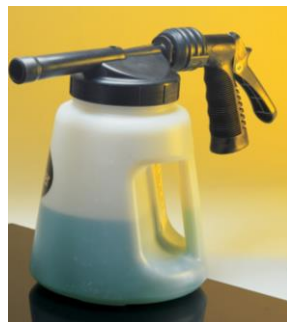
88681 96 ounce Hydro-foamer