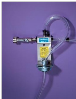
88208 Drum or Wall mount, high flow