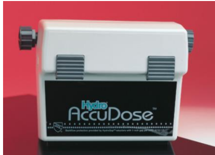
88411 double, both low flow 88441 double, both high flow 88461 double, 1 low, 1 high flow