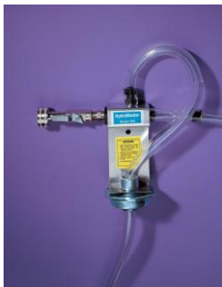
88208 Drum or Wall mount, high flow