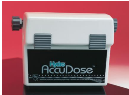
88411 double, both low flow 88441 double, both high flow 88461 double, 1 low, 1 high flow