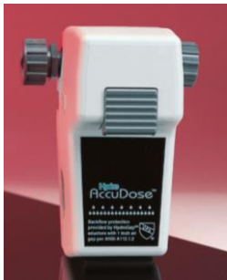
88301 single, low flow 88331 single, high flow