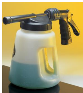
88681 96 ounce Hydro-foamer