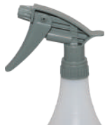
GRAY CHEMICAL RESISTANT TRIGGER SPRAYER